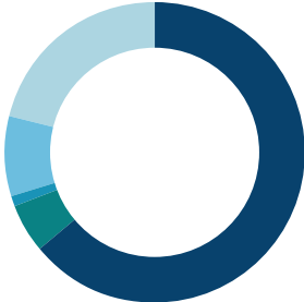
TOTAL REVENUE $42.4M

Your kind donations, combined with our partnerships with local government, public, and private companies, amplify the impact we make together in our communities. This funding allows us to develop individual support plans that create lasting change and put people back on their feet for life.